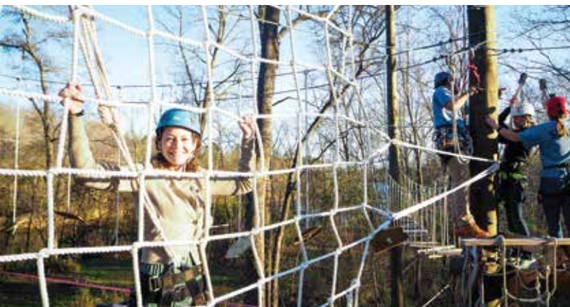
HIGH ADVENTURE COURSE