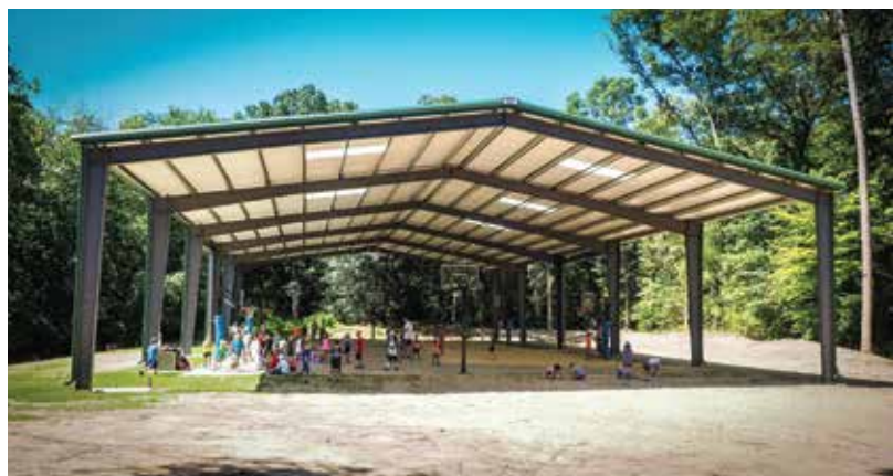
COVERED BASKETBALL COURT