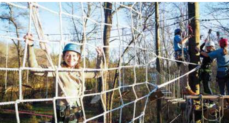
HIGH ADVENTURE COURSE