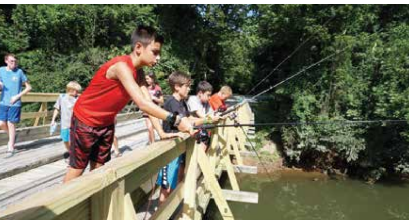
ACCESS TO FISHING